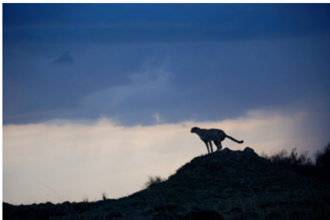
Cheetah were a common site in the Mara Triangle this August

there four days and had killed five wildebeest; a further 17 snares were recovered.