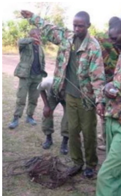
Rangers pile up snares. The total number of snares collected in August was 838.

On the whole we managed to keep expenditure in check. Given that the Country has been experiencing 30-40% inflation in the past six months we did remarkably well in keeping expenditure to 4% above the previous year. Salaries went up by 10% as a result of instituting a pension plan, there was a major increase in depreciation as a result of purchasing the new grader and we had two major evacuation and hospital bills for staff as a result of an accident and gun-shot wounds. In almost all other fields we were able to make significant reductions in costs – a tribute to our staff and administration.