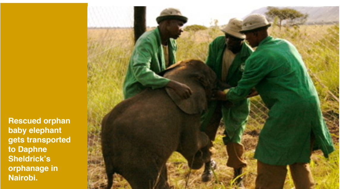
Rescued orphan baby elephant gets transported to Daphne Sheldrick's orphanage in Nairobi.