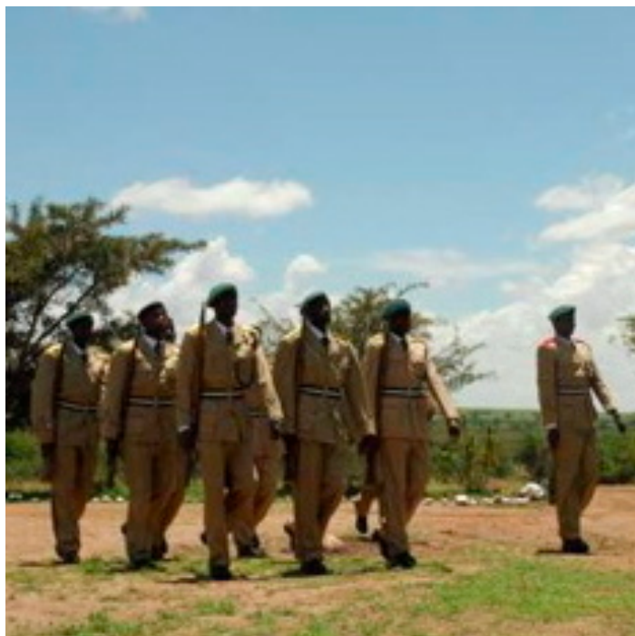
Congratulation for eight council rangers on completing their course and their excellent performance during the passing-out parade.