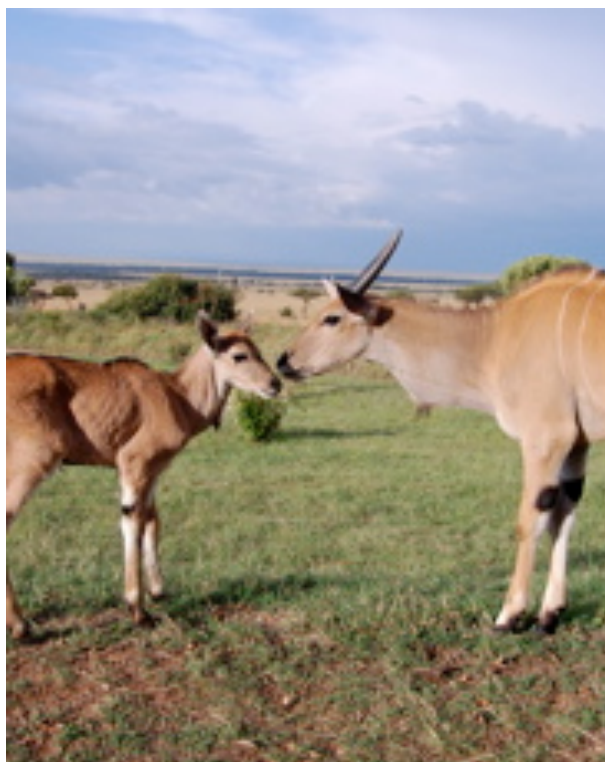
Resident Eland, Bahati, welcomes four day old baby eland at Oloololo Gate.