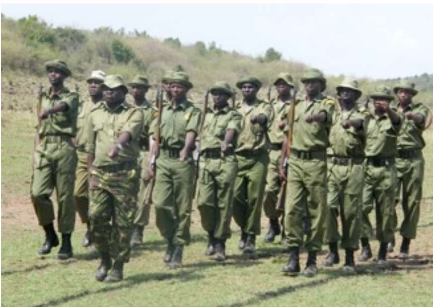
New recruits march on parade.

A patrol on the 24 th found a number of old snares, six in all, and two desiccated wildebeest carcasses. The patrol also arrested three youths who were hunting with dogs near Kokamange in the Lemai Wedge. Three women were also caught for collecting firewood in the Serengeti