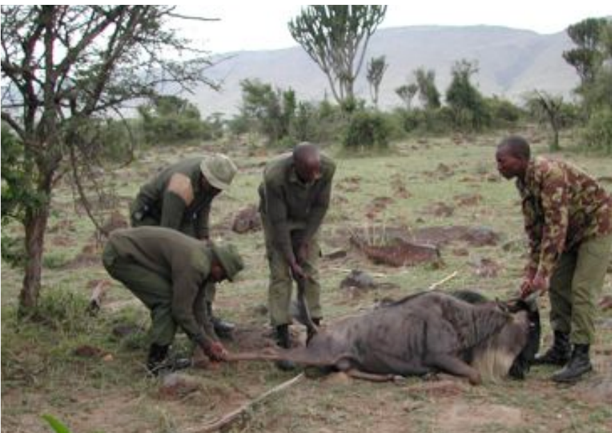
Ngairo-are Rangers free a wildebeest caught in a wire snare.