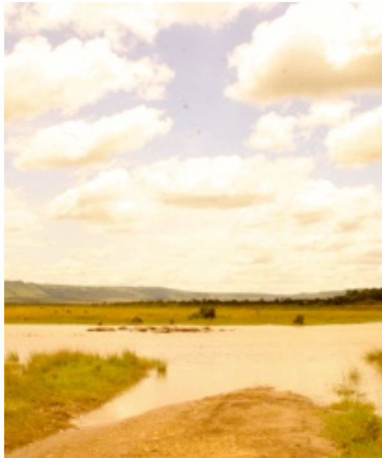
A pod of hippos in the Mgoro lugga.

The Kenya Wildlife Service (KWS) is planning an ear-notching and radio tracking exercise in early June. This will be the third time that they have come down to ear-notch the Mara rhino population, but the first time that they will have installed transmitters in rhino horns. This exercise will help in identification and tracking of the Mara rhinos.